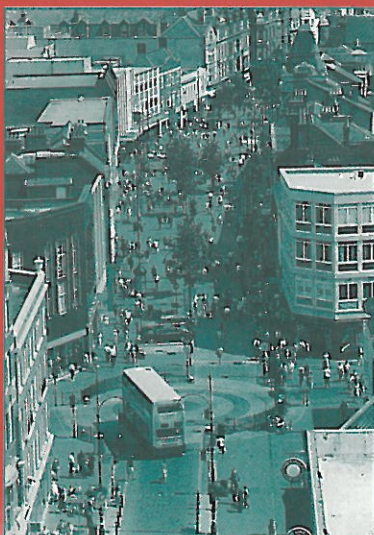
READING TOWN CENTRE